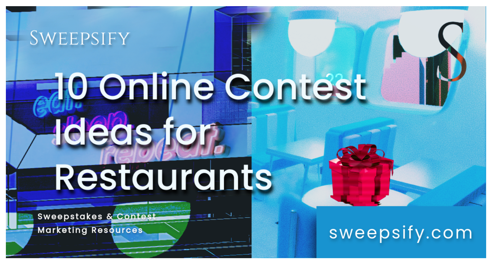
10 Online Contest Ideas for Restaurants

Here is a list of our current affiliate partners and how we earn money